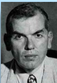
Fuller Albright, MD